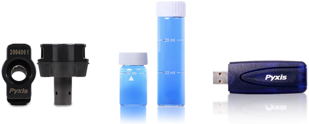
16mm COD Adapter

Each SP-800 comes equipped with one set of MA-24 (10mL) and MA-25 (25mL) sample vials, one 16-mm COD Vial Adapter (P/N 52214) and one MA-NEB Bluetooth USB Adapter.