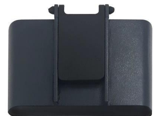
SP-600 Wireless pH/ORP Module